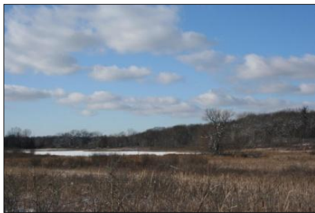
Davis Lake Overlook

Allocation of property tax revenue by Township fund. This does not include school funding.