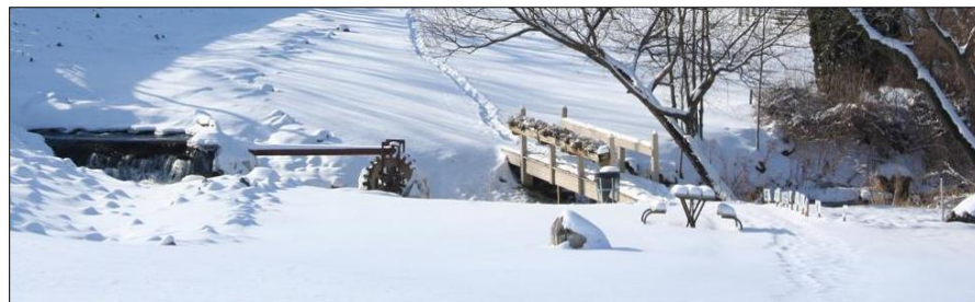
Davisburg Rotary Park